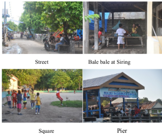
Figure 3. Public Space in Barrang Lompo Island