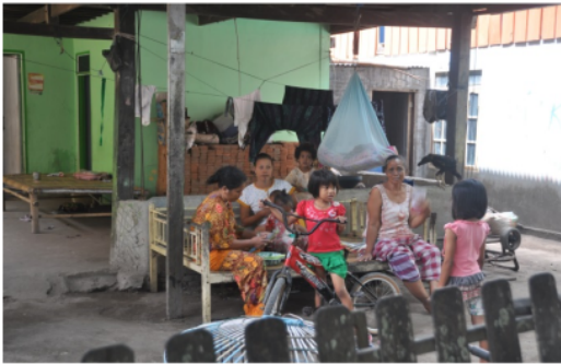
Figure 1. Bale bale at courtyard as public space

Gatherings are a habit or culture cultivated by the islanders in the public space of Barrang Lompo Island. The space that is used as a gathering place is not just a planned space, but a space that is spontaneously created. This space is a social space that arises spontaneously when two or more people meet [11].